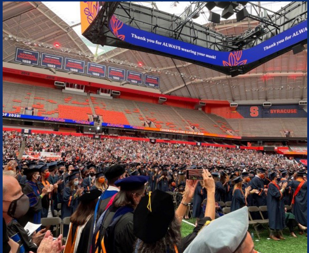
Syracuse University's Dome on Graduation Day