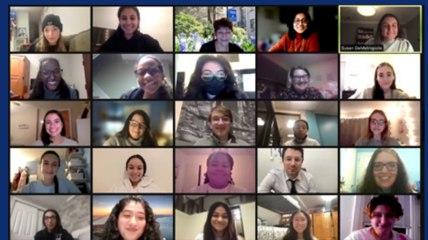
The NSSLHA Book Club with Hofstra University