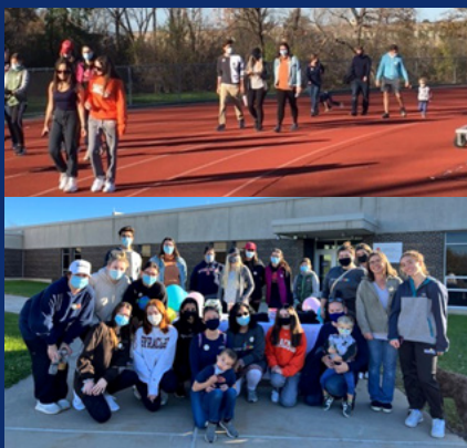
NSSLHA Apraxia Kids Walk